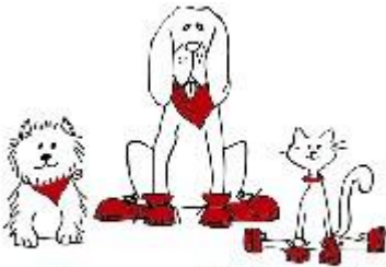
Ya gotta walk the walk!

As the seasons change, so do the challenges facing us at Burlington Humane! Kitten season started early and has every expectation of finishing late, thanks to the weather prolonging outdoor activities of all kinds.