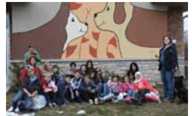
As a Community Helper, a class from Pauline Johnson school held a fundraiser.