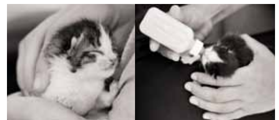
Kittens on July 24