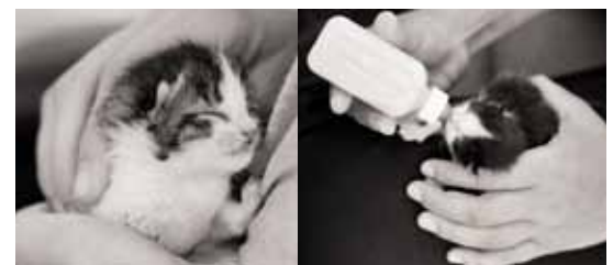
Kittens on July 24