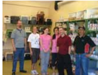
Thanks to a group of volunteers from Eaton Yale Company who joined some of our staff to clean and reorganize the storage room! It looks GREAT!