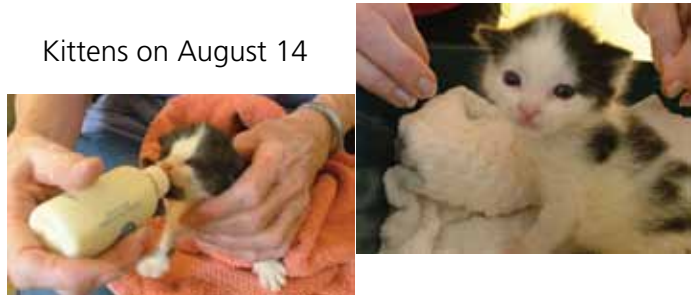
Kittens on August 14

It is through the dedication and caring of our foster parents that kittens such as these grow and have another chance. If you are interested in caring for tiny kittens such as these, please get in touch with us. You will have the satisfaction of knowing that you have made a difference, of being the reason for them surviving and thriving, and giving pleasure to so many as they are adopted and become part of their forever home.