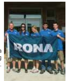
Thanks to a group from Rona who spent the day gardening at the shelter.