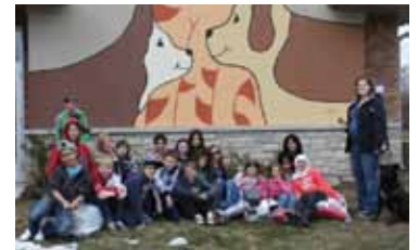
As a Community Helper, a class from Pauline Johnson school held a fundraiser.