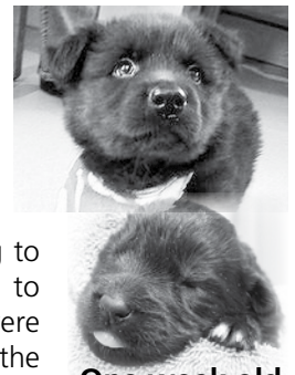
One week old

When I received the email from Burlington Humane calling for foster families for a litter of puppies that had been found in a sack, the story tugged at my heart. Picturing these abandoned puppies struggling to stay alive, I knew I couldn't say no to helping. After all, these puppies were less than a week old and needed all the support they could get! When I went to the shelter to pick up my little guy, I was shocked by how very tiny he was, just fitting into the palm of my hand. His eyes were not open, as he was still far too young. We were warned that the pups might not make it, as they had suffered a severe trauma.