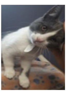
Tesla and Ferrari