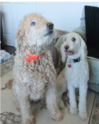
Me and Sam

I had to spend two weeks in that crate, staying as still as possible, and let me tell you that is not easy for a young pup! My only outings were to the garden on a