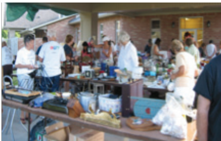
BHS Garage Sale

Don't forget the Christmas Sale in November – this year it will be a three day sale. Shop early and shop often! Each day, new items will be unpacked!