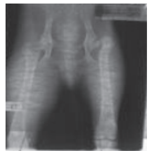
X-ray of Zak's hip

Surgery was successful on his hip and he was recuperating, but he could not start heartworm treatment until he was stronger. Zak was sedated for x-rays on his leg when he passed away. A postmortem showed 18 adult heartworms present. Adult heartworms can grow up to 12 inches and weaken an animal significantly.