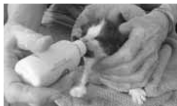
Kittens on August 14

It is through the dedication and caring of our foster parents that kittens such as these grow and have another chance. If you are interested in caring for tiny kittens such as these, please get in touch with us. You will have the satisfaction of knowing that you have made a difference, of being the reason for them surviving and thriving, and giving pleasure to so many as they are adopted and become part of their forever home.