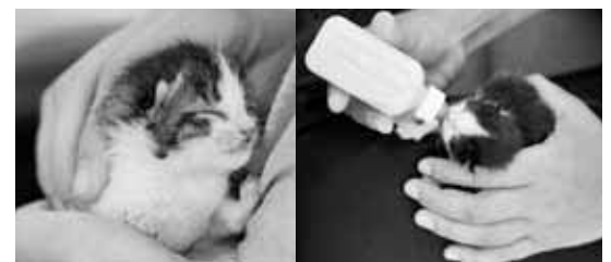
Kittens on July 24