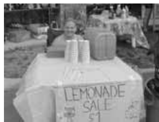
Julia sold lemonade at the garage sale.