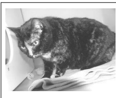
Myla - our new longest resident found May 2011. She is very quiet and loves to cuddle!

As always, we are fortunate to have so many wonderful and dedicated volunteers who spend their time to help the stray and abandoned animals that come into our facility. From all the animals hearts I know they thank you for all that you do for them during their time of greatest need. It fills my heart with joy to see the vast number of volunteers who help out each week. Whether it's walking the dogs, fostering, volunteering on reception, feeding and cleaning the cats, or making beds for the cages and catnip mice to sell and for the cats to play with, you are always there to lend a hand. Each and every one of you makes BHS a more humane place for all the animals. It is an honour and a pleasure to work with you.