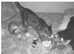
Zephra – Emily's quality control cat adopted from BHS!