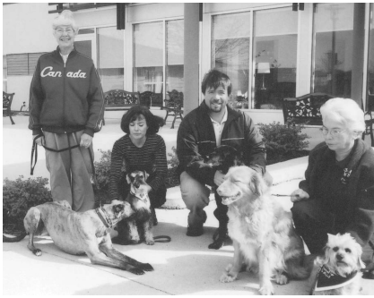
Pet Therapy team members and their dogs outside Burloak Long-term Care.

Pet Therapy will wind up their year of visiting with residents at many retirement and nursing homes in the city. The program runs from Sept/Oct through May as long as weather is not too warm for the animals.