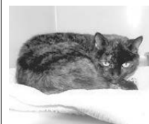
Pekay is 11 years old and was surrendered because she had a urinary tract infection. She does have some health issues but her loving nature makes up for everything – she loves to hug!