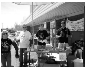
Rona BBQ sales workers!

If you have a dog who loves people and you have some time to make someone else's life a little happier, consider joining the BHS Pet Therapy program. More information is available on the website or by calling the shelter.