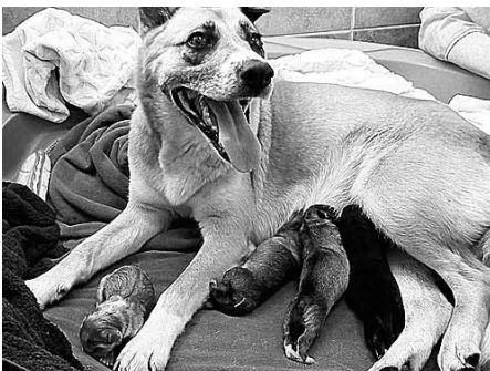
Lily and her Pups

Several of these dogs desperately need foster homes to provide them with love and a safe haven while they are brought back to health. If you have room in your home and your heart, please contact us. In spite of their past treatment, they ask so little and give so much.