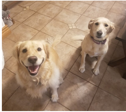
Benji with his new forever best friend, Bailey.

If nothing was done, pressure would build up resulting in a lot of pain. Benji had not been able to see out of that eye for some time. Two options were discussed, removing some of the scar tissue with the hope it would relieve